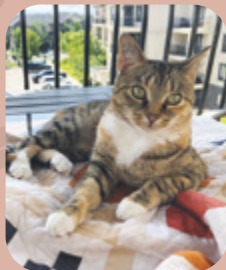
Willow, McKenzie Towne

To have your pet featured, email news@mycalgary.com