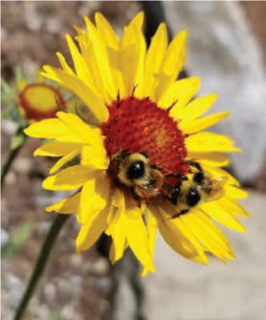
Brown-eyed Susan ( Gaillardia aristata ) with two native bees