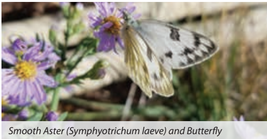
Smooth Aster ( Symphotrichum laeve ) and Butterfly

H: Yes, and they are beautiful too. I love spending time in the mountains, and having similar flowers in my yard is simply amazing. I started many from seeds, purchased some as plugs, and I'm part of the Alberta Native Plant Rescue group. We work with construction companies to rescue plants before they clear sites. For example, we've rescued plants from a highway project near Cochrane and a future residential area close to Seton. It's important to note that it's illegal to take flowers from the wild, so these organized events are fantastic opportunities to get free plants and contribute positively to the environment.