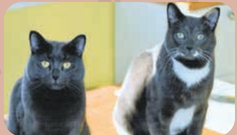
Sir Gawain and Sir Tristan, Woodbine

To have your pet featured, email news@mycalgary.com