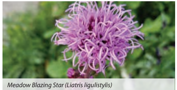
Meadow Blazing Star ( Liatris ligulistylis )

H: Not more than other plants. I'm in front of a computer all day, so spending time outside is relaxing. And I love all the new people I've met since I changed my front yard. Most of them pass by when they walk their dogs and stop to chat.