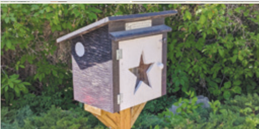
61 Fawn Crescent SE Playground