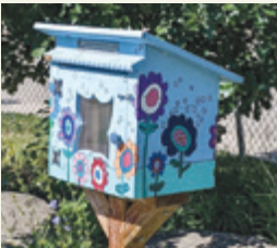
45 Flavelle Rd SE

You can read more about LFLs and how they work at littlefreelibrary.org .