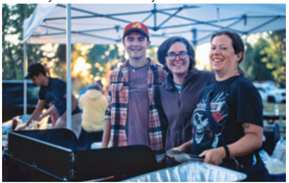
Fall Family Film Festival 2022 by Kevin Saruwatari

exclusive VIP seating draws! Our LED screen ensures perfect viewing throughout the day.