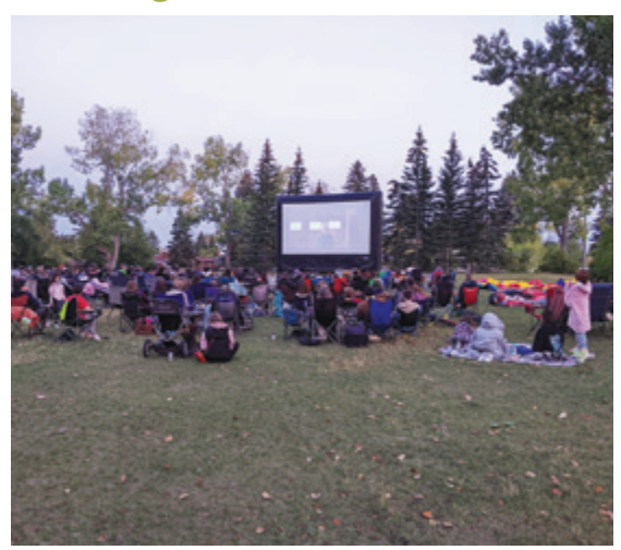
Movie in the Park 2023

Join us for a special day of fun on Saturday, September 13 as we mark Fairview Community's 65th anniversary with our Fall Family Festival and Film night!