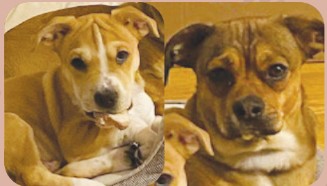
Tucker and Bentley, McKenzie Towne

To have your pet featured, email news@mycalgary.com