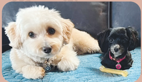
Howie and Pepper, Crestmont