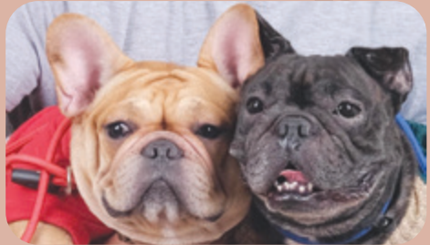
Basha and Molly, Elbow Scene