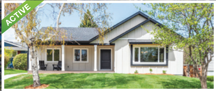
1116 Lake Wapta PL SE: $1,339,800