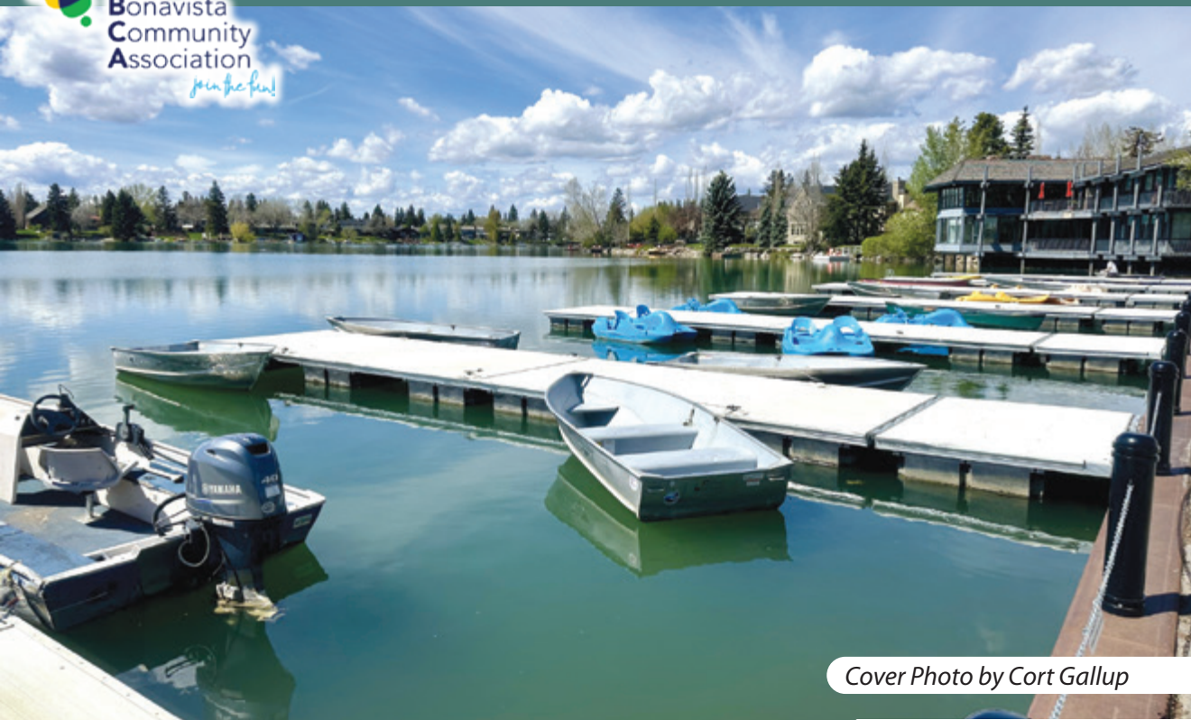
Cover Photo by Cort Gallup