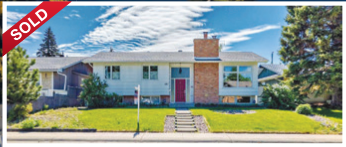
787 Lake Twintree CR SE: $805,000