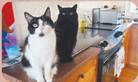
Meatball and Cleo, Renfrew