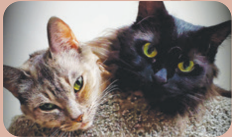
Ash and Bella, Cranston