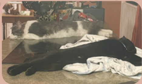
Flair and Little Lady, Strathcona Park