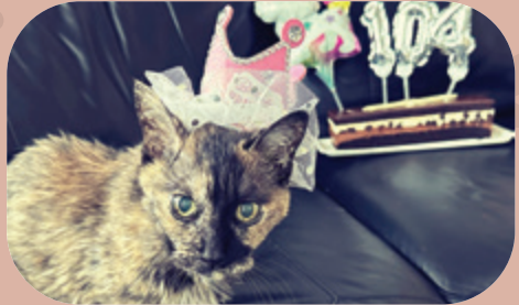
JC Cat, Evanston