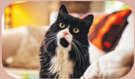
Tuxedo Joe, Cranston

To have your pet featured, email news@mycalgary.com