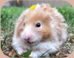
Biscuit, Deer Run