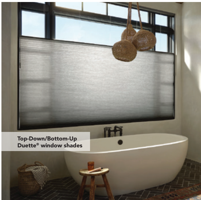
Top-Down/Bottom-Up Duette® window shades