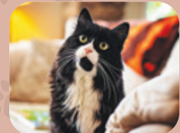
Tuxedo Joe, Cranston

To have your pet featured, email news@mycalgary.com