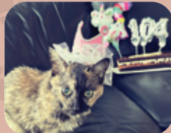
JC Cat, Evanston