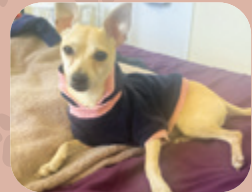
Sparky, Douglas Glen

To have your pet featured, email news@mycalgary.com