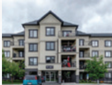
1310, 310 McKenzie Towne Gate SE $464,900