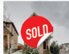
126 Marquis Common SE