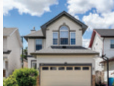
239 Bridlewood Circle SW $614,900