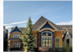
123 Mahogany Bay SE $2,449,900