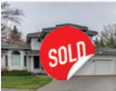
12090 Diamond View SE