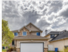
25 Cranston Drive SE $824,900