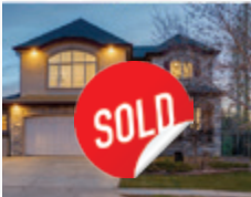
19 Elgin Estates Hill