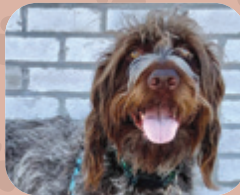
Otto, Crescent Heights