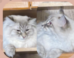
Spook and TenSoon, Crescent Heights

To have your pet featured, email news@mycalgary.com