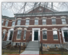
8 Promenade Way SE New Listing!