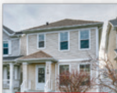
140 Prestwick Villas SE $529,900