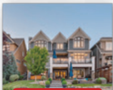
119 Mahogany Bay SE $2,498,900