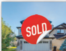
51 Brightondale Crescent SE