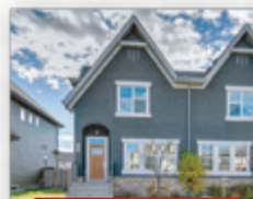
620 Mahogany Blvd SE $532,900