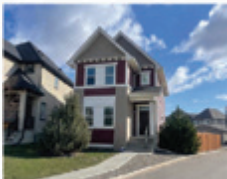
126 Marquis Common SE $659,900