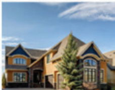
123 Mahogany Bay SE $2,488,800