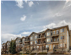
1, 21 McKenzie Towne Gate SE $339,900