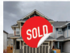
62 Magnolia Terrace SE