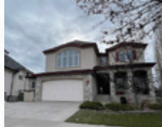
19 Elgin Estates Hill SE $1,189,900