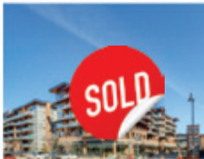
510, 122 Mahogany Centre SE