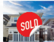
71 Masters Rise SE