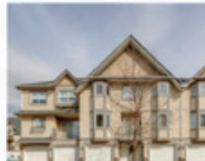
108 Cedarwood Lane SW $474,900