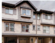
35 New Brighton Point SE $414,900