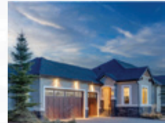
60 Cranbrook Landing SE $1,249,900