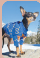
Mirabella, Lower Mount Royal