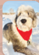
Poupie, Deer Run