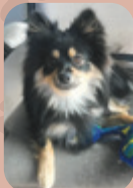
Lizzy, Huntington Hills