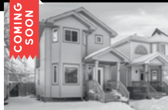
172 Chaparral Ridge Circle SE