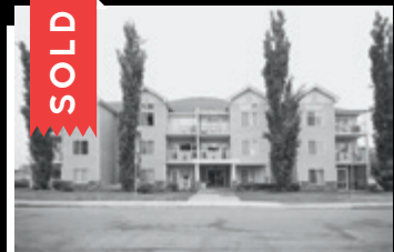
7720 39 Avenue NW # 1