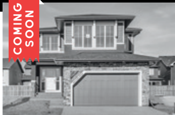
464 Legacy Boulevard SE

Stats current as of September 30, 2023 @ 11:59 pm. For more detailed market sales information, please contact Team Palmer at 403.836.3018 or info@teampalmer.ca.