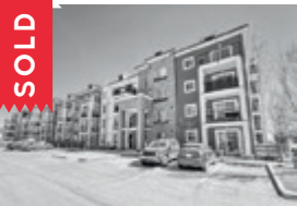
99 Copperstone Park SE

Stats current as of June 1, 2024 @ 11:59 pm. For more detailed market sales information, please contact Team Palmer at 403.836.3018 or info@teampalmer.ca.