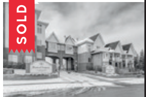
15 Everstone Dr. SW # 107