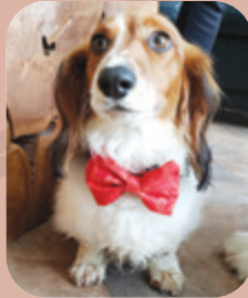
Toby, Patterson Heights

To have your pet featured, email news@mycalgary.com