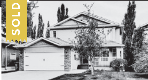
354 Mountain Park Drive SE