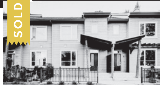
61 Chapalina Square SE