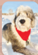
Poupie, Deer Run