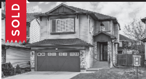
168 Brightondale Close SE