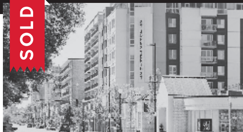
1110 3 Avenue NW # 203