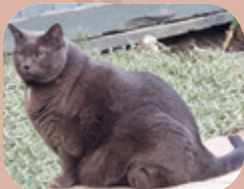
Big Earl, Capitol Hill