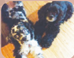
Blue and Jere, Mount Pleasant