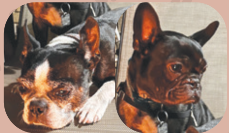
Tiffany and Maggie, Calgary

To have your pet featured, email news@mycalgary.com