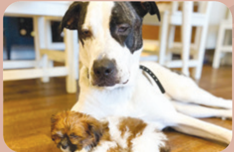
Teddy and Sassy, Foothills