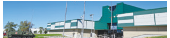
The Military Museums of Calgary, Alberta, September 2024.