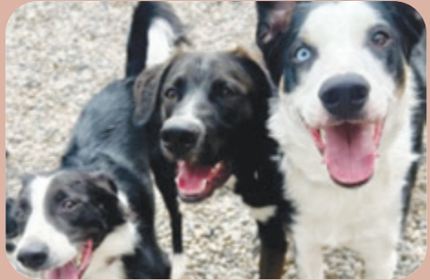
Bowser, Remus, Riku, Montgomery