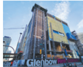
Glenbow Museum, circa 1976, undergoing extensive renovations, November 2023.