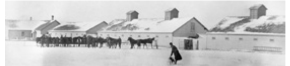
"North-West Mounted Police, Fort Calgary, Alberta.", 1895, (CU1156910) Q. M. stores at left, stables at right. https://digitalcollections.ucalgary.ca/asset-management/2R3BF1FT7ZBN?WS=SearchResults.