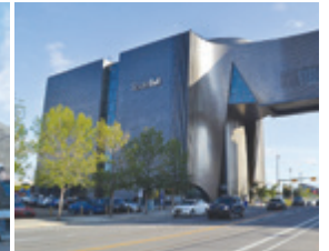
Studio Bell, Calgary, September 2019.