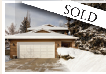
126 Parkview Pl SE