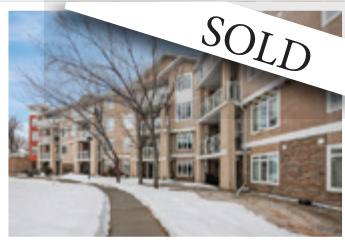
#211, 40 Parkridge Pl SE