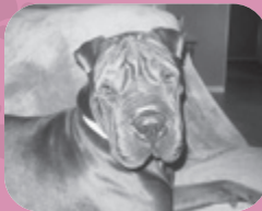
Rigby, Huntington Hills