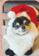
Pedro, Sandstone Valley