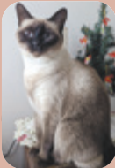
Echo, Signal Hill