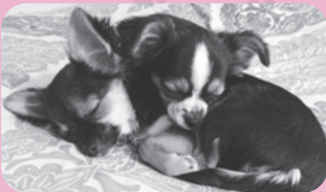
Tiger and Lily, Evanston

To have your pet featured, email news@mycalgary.com