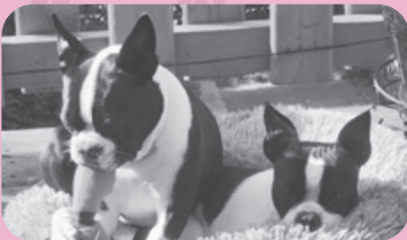
Thor and Loki, Shawnessy