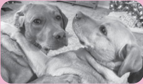
Lake and London, Cranston