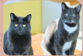
Sir Gawain and Sir Tristan, Woodbine

To have your pet featured, email news@mycalgary.com