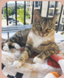
Willow, McKenzie Towne

To have your pet featured, email news@mycalgary.com