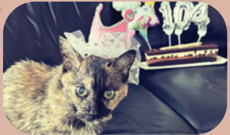
JC Cat, Evanston