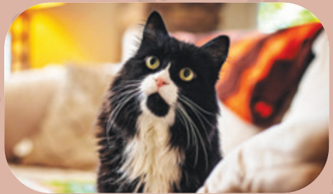
Tuxedo Joe, Cranston

To have your pet featured, email news@mycalgary.com