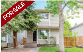
143 RIVERVALLEY CR $564,900