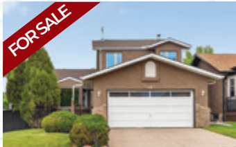
66 RIVERSIDE CI $764,900