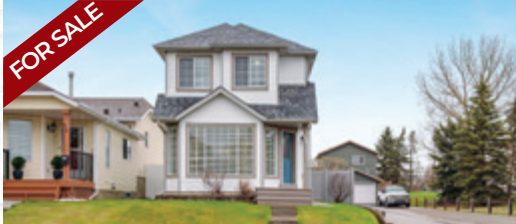
49 RIVERCREST CL $549,900