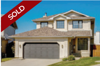
RIVER ROCK MR