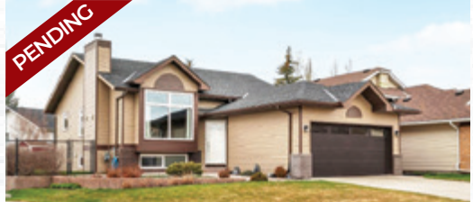
79 RIVERSTONE CR $589,900