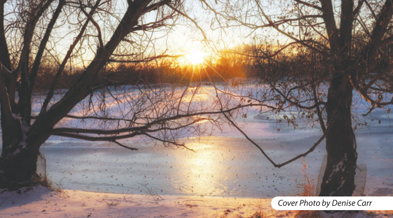
Cover Photo by Denise Carr

THE OFFICIAL RIVERBEND COMMUNITY NEWSLETTER