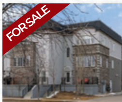
352 QUARRY PARK BLVD $689,999