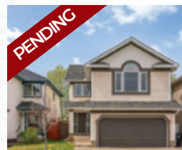
51 RIVER ROCK PLACE $759,900