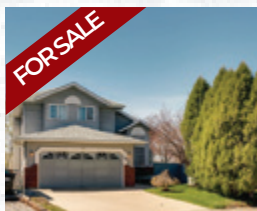
95 RIVERSIDE CLOSE $889,500