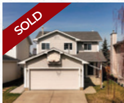
RIVER ROCK MANOR