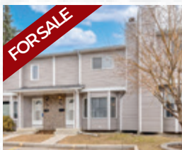
171 RIVERGLEN PARK $414,900