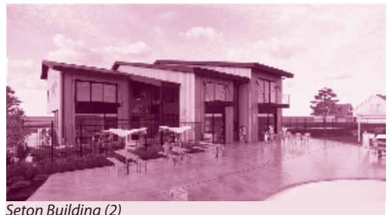
Seton Building (2)