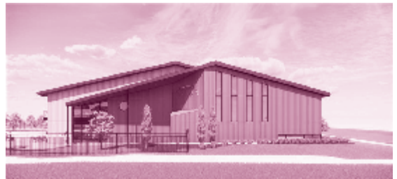
Seton Building (1)