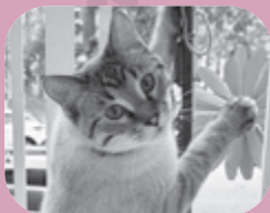
Chigs, Crescent Heights