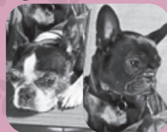
Tiffany and Maggie, Calgary

To have your pet featured, email news@mycalgary.com