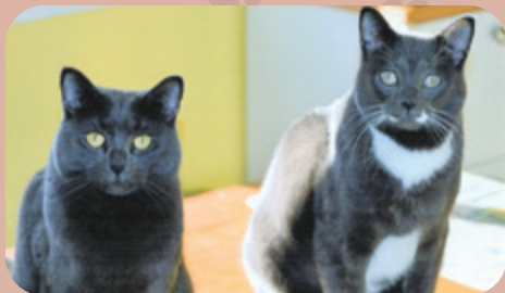
Sir Gawain and Sir Tristan, Woodbine

To have your pet featured, email news@mycalgary.com