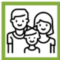
Family Membership $35