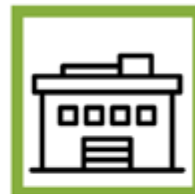
Business Membership $40