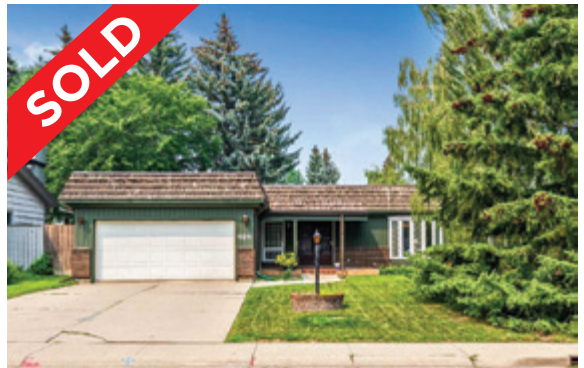
CANTERBURY PLACE SW

CONTACT US FOR YOUR FREE EVALUATION: INFO@SMITHPEZZENTE.COM