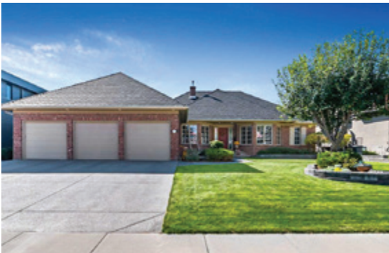
12931 CANDLE CRESCENT SW