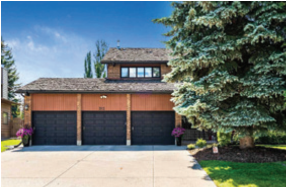
312 CANTERVILLE DRIVE SW