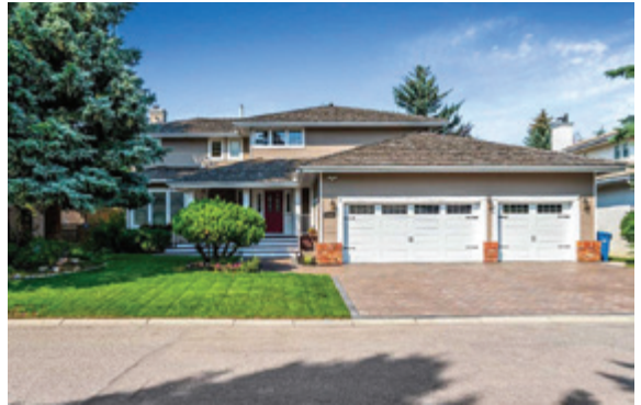
210 CANOVA CLOSE SW