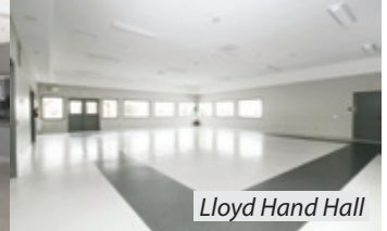
Lloyd Hand Hall