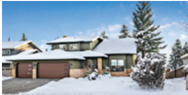
260 CANTERVILLE DR SW