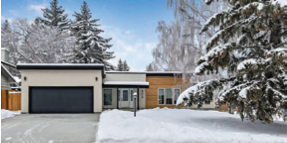
404 CANTERBURY PL SW