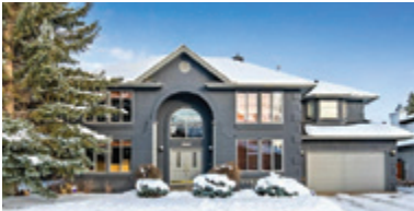
12940 CANDLE CRES SW