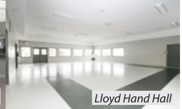
Lloyd Hand Hall