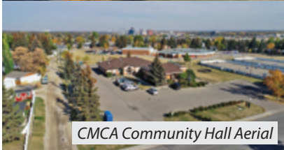
CMCA Community Hall Aerial