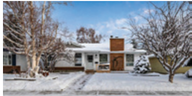
12040 CANDIAC ROAD SW