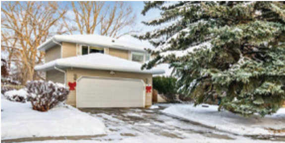
244 CANNINGTON PL SW