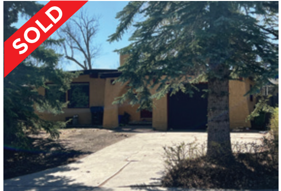
151 CANNELL PLACE SW