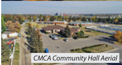
CMCA Community Hall Aerial