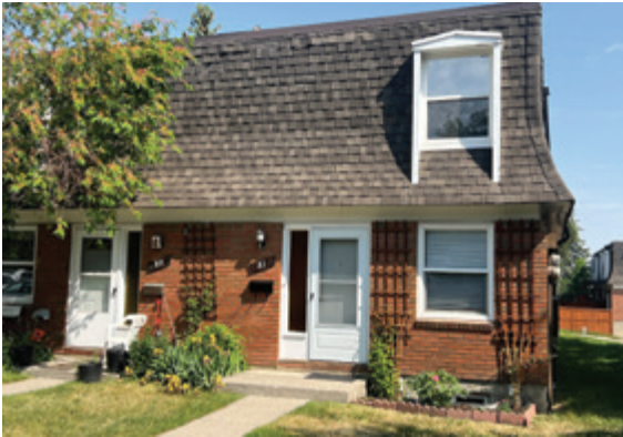
#81, 330 CANTERBURY DRIVE SW