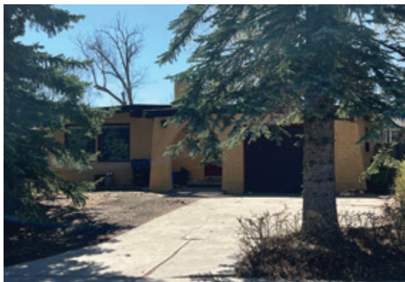
151 CANNELL PLACE SW