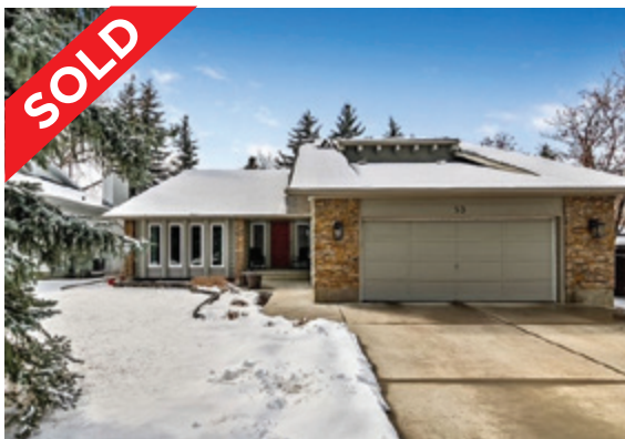
53 CANOVA ROAD SW