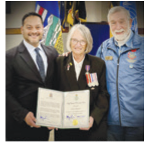
Honouring our veterans at the Horton Road Royal Canadian Legion.

As summer and Canada Day celebrations kick off, we reflect on the promise of Canada.