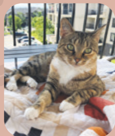
Willow, McKenzie Towne

To have your pet featured, email news@mycalgary.com