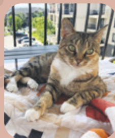
Willow, McKenzie Towne

To have your pet featured, email news@mycalgary.com