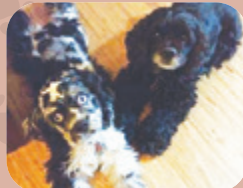
Blue and Jere, Mount Pleasant