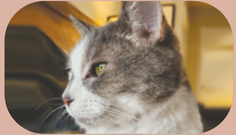
Squeeks, Mount Pleasant