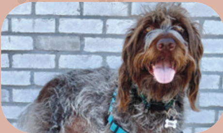
Otto, Crescent Heights