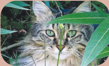
Luna, Canyon Meadows