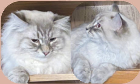
Spook and TenSoon, Crescent Heights

To have your pet featured, email news@mycalgary.com