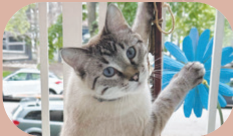
Chigs, Crescent Heights