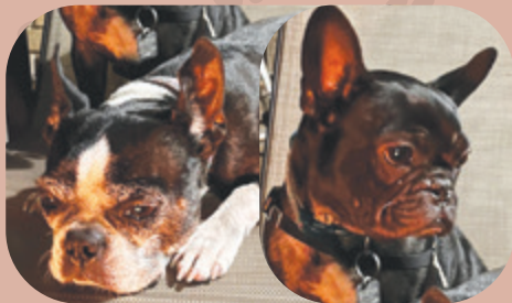
Tiffany and Maggie, Calgary

To have your pet featured, email news@mycalgary.com